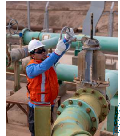
Operation & Maintenance